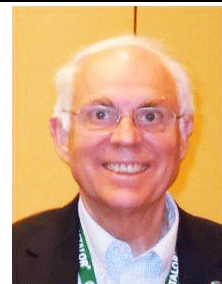
Joe Soucy Photo/Proceedings Draper